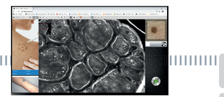
1 Image capturing